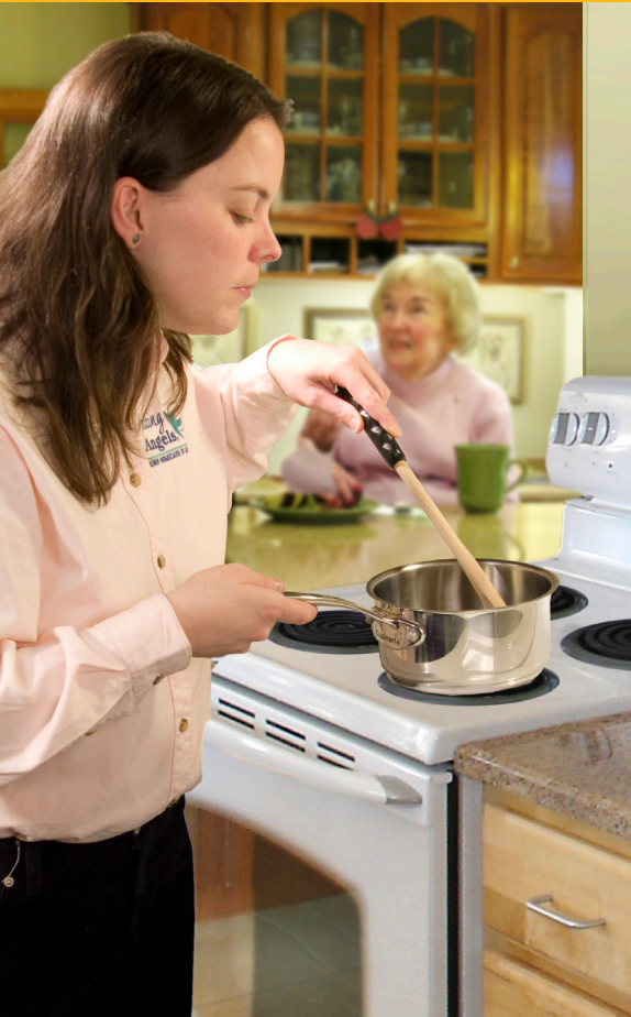
Saugatuck Homecare, Inc. - Fairfield, CT

The Park City, once known as a leader in commerce throughout New England, is in the midst of a vital transformation. Entrepreneurs, developers and families are seeking the affordable opportunities and diversity that Bridgeport and the region offers. Regional leaders are taking steps to plan for and accommodate revitalization and growth. Community Capital (CommCap) serves as a partner to all. From small business to affordable housing to nonprofits to participation in big developments, CommCap loans are providing financing for a Greater Bridgeport.