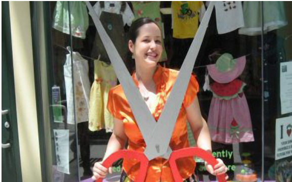
Gumdrop Swap - Downtown Bridgeport

The Link is CommCap’s small business services program. With generous support from Citi Community Development, The Link: » Provides Coordinated support, information and one-on-one technical assistance to small businesses in Bridgeport » Connects businesses to numerous resources available to small businesses in the region seeking, technical assistance, training, financing, networking opportunities, and market information.